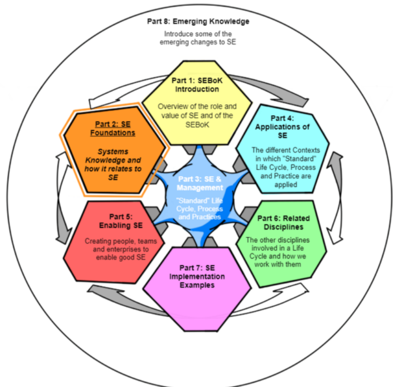
Figure 1. SEBoK Part 2 in context (SEBoK Original). For more detail see Structure of the SEBoK

Part 2 of the Guide to the SE Body of Knowledge (SEBoK) is a guide to foundational knowledge which is relevant or useful to systems engineering (SE).