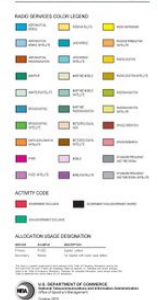
Figure 2. The Radio Spectrum (Department of Commerce 2003). Released by the U.S. Department of Commerce. Source is available at http://www.ntia.doc.gov/files/ntia/publications/2003-allochrt.pdf (Retrieved September 15, 2011)